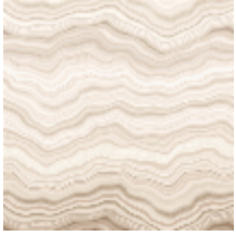
6446-01 CARRARE MARBRE