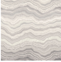
6446-02 CARRARE GRANIT