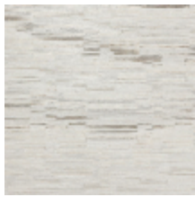
6448-01 RABANE NATUREL