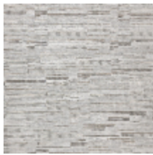
6448-02 RABANE NUAGE