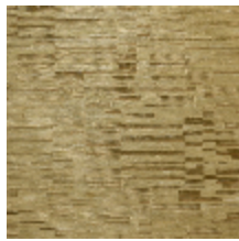
6448-03 RABANE GOLD