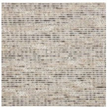
6458-01 ONDULATION - GREGE