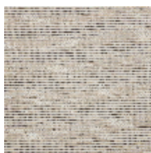
6458-01 ONDULATION - GREGE