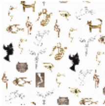
6463-02 JOYAUX - IVOIRE