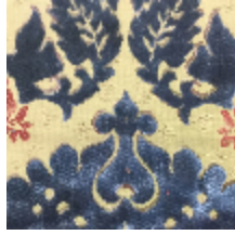
0647-03 VEL.RAVENNE- SAPHIR