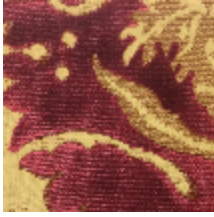
0647-02 VEL.RAVENNE- RUBIS