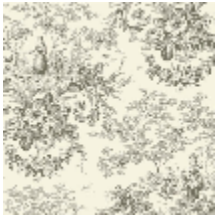
6491-01 BEAUX JOURS - CENDRE