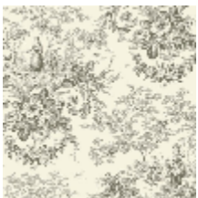
6491-01 BEAUX JOURS - CENDRE