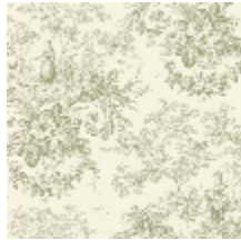
6491-03 BEAUX JOURS - TILLEUL