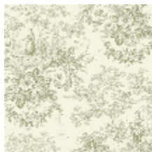
6491-03 BEAUX JOURS - TILLEUL