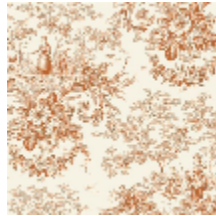
6491-04 BEAUX JOURS - TERRACOTTA