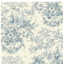
6491-02 BEAUX JOURS - FAIENCE