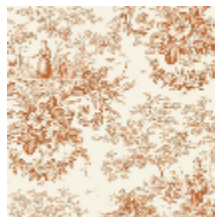
6491-04 BEAUX JOURS - TERRACOTTA