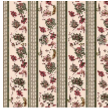
6495-03 AGLAÉ - PRINTEMPS