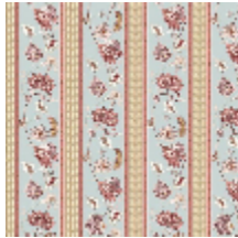
6495-02 AGLAÉ - BOUDOIR