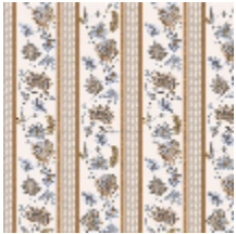
6495-01 AGLAÉ - NATUREL