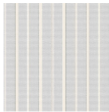
6498-04 RAYURE MLE - BLEUET