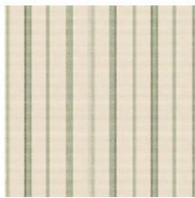
6498-02 RAYURE MLE - PRINTEMPS