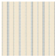
6498-03 RAYURE MLE - PORCELAINE