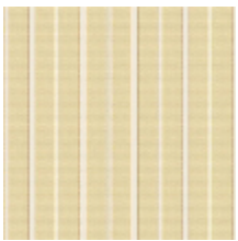
6498-01 RAYURE MLE - PAILLE