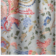
0650-01 LES REVERIES - CELADON