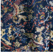
0650-02 LES REVERIES - INDIGO