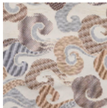
0651-03 ALIZE - NUAGE