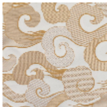
0651-02 ALIZE - SABLE