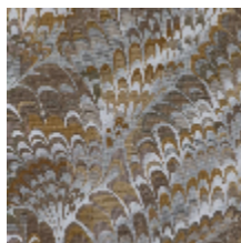
0654-03 DIVIN - NATUREL