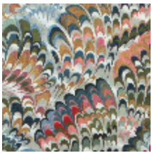
0654-01 DIVIN - CELADON