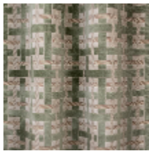
0655-01 LACIS - CELADON