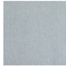
0657-17 ATHENA - GLACIER