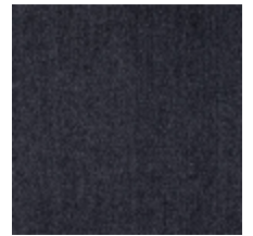
0657-24 ATHENA - ANTHRACITE