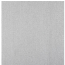
0657-19 ATHENA - PERLE