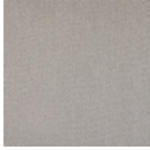
0657-02 ATHENA - BEIGE