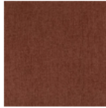
0657-10 ATHENA - TERRACOTTA