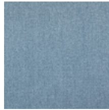
0657-16 ATHENA - ACQUA