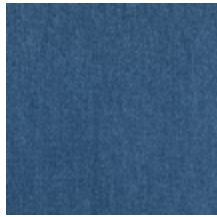
0657-15 ATHENA - OCEAN