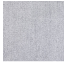
0657-18 ATHENA - CENDRE