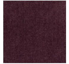
0657-12 ATHENA - BURGUNDY