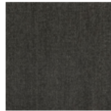
0657-23 ATHENA - ECORCE