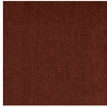
0657-09 ATHENA - BLUSH