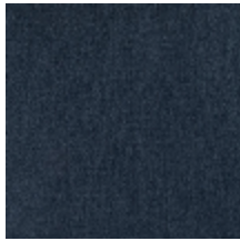
0657-14 ATHENA - ARDOISE