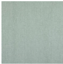
0657-20 ATHENA - CELADON