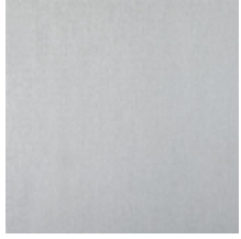
0657-01 ATHENA - ECRU