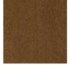
0657-06 ATHENA - BRONZE