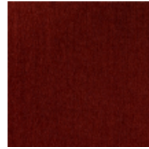
0657-11 ATHENA - ACAJOU