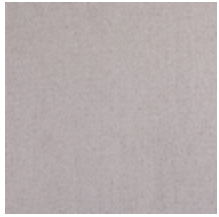
0657-07 ATHENA - POUDRE