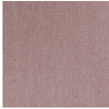
0657-08 ATHENA - PETALE