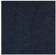
0657-13 ATHENA - NUIT