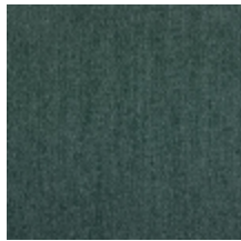
0657-21 ATHENA - AGAVE