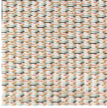
6596-02 TAPIS PLUMETTE CELADON