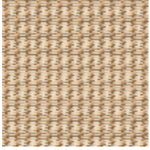
6596-01 TAPIS PLUMETTE NATUREL