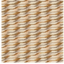
6597-01 TAPIS PLUMAGE NATUREL