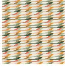
6597-01 TAPIS PLUMAGE NATUREL