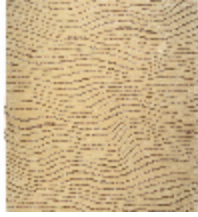
6637-02 TAPIS ONDES DUNE