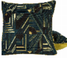
6791-02 COUSSIN KISALE COME