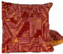
6791-03 COUSSIN KISALE CORAIL