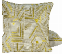
6791-04 COUSSIN KISALE SOLEIL