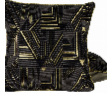
6791-05 COUSSIN KISALE FUMOIR