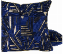
6791-01 COUSSIN KISALE MARIN