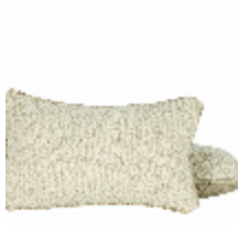
6810-02 COUSSIN ANDES NATUREL