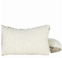
6810-01 COUSSIN ANDES CRAIE