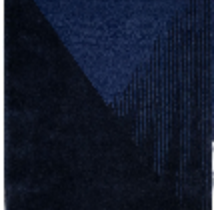
6860-01 TAPIS GLAUKO INDIGO