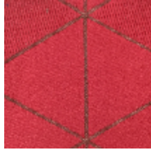
0712-03 NASSE M1 - VENISE