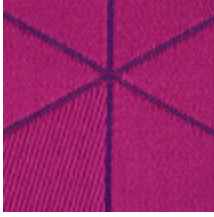
0712-02 NASSE M1 - INDIEN