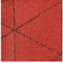
0712-01 NASSE M1 - PIMENT