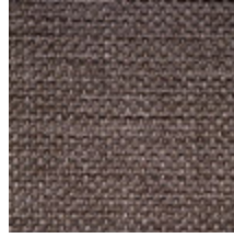
0714-04 HAREM M1 - GRANIT