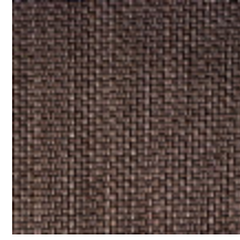
0714-05 HAREM M1 - TAUPE