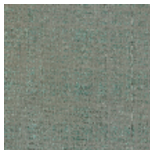
0726-09 PIETRA - ARGILE *