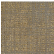
0726-08 PIETRA - PYRITE