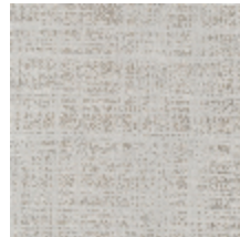
0726-05 PIETRA - MARBRE