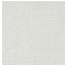
0726-04 PIETRA - CRAIE