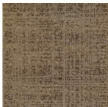
0726-07 PIETRA - OR