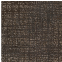
0726-01 PIETRA - TITANE