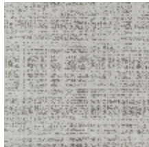
0726-03 PIETRA - PLATINE *