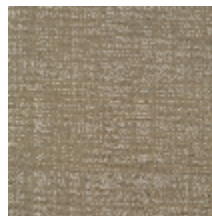
0726-10 PIETRA M1 - VERMEIL