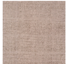
0726-06 PIETRA - POUDRE