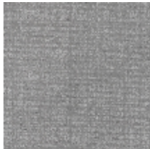
0726-02 PIETRA - ARGENT *