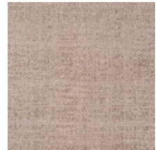
0726-06 PIETRA M1 - POUDRE