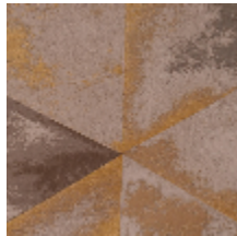
0727-03 METALO MI - SILEX