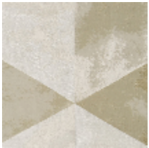
0727-01 METALO MI - EMAIL *