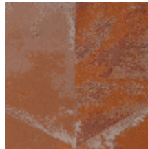
0727-04 METALO MI - CUIVRE