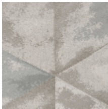
0727-02 METALO MI - GLACIER