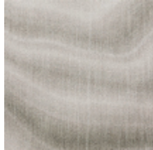
0733-03 CARRIERE MI - QUARTZ