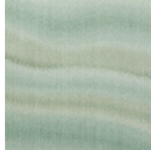
0733-04 CARRIERE MI - JADE