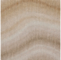
0733-01 CARRIERE MI - ONYX