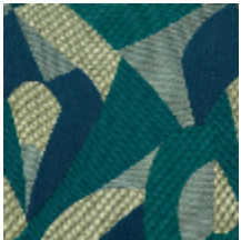
0735-01 TCHIN MI - PARC