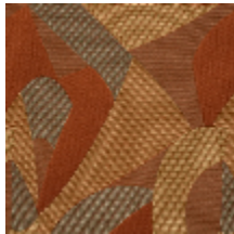
0735-02 TCHIN MI - SOULIER