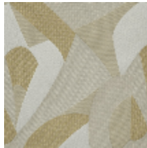
0735-03 TCHIN MI - ECLAT