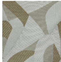
0735-04 TCHIN MI - PALAIS