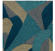
0735-06 TCHIN MI - FOURREAU