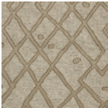
0737-01 SILLON MI - KAOLIN