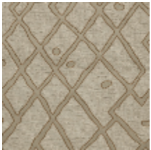
0737-01 SILLON MI - KAOLIN