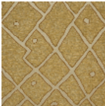
0737-02 SILLON MI - OCHRE