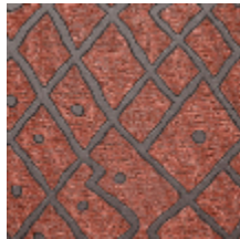
0737-04 SILLON MI - TERRE DE SIENNE