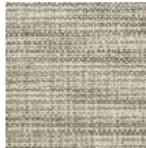
0746-04 MANGROVE MI - FICELLE