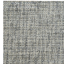
0746-05 MANGROVE MI - GIVRE