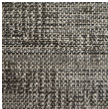
0746-02 MANGROVE MI - ARDOISE