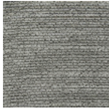
0750-09 COCOA MI - PERLE *