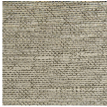
0750-08 COCOA MI - CHAMPAGNE