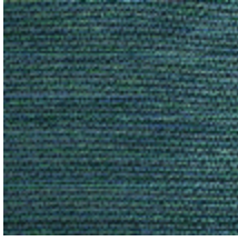
0750-02 COCOA MI - PAON *