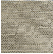
0750-08 COCOA MI - CHAMPAGNE