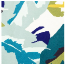
0752-01 PALMA MI - PAON