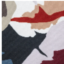
0752-03 PALMA MI - FAISAN