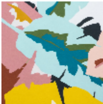
0752-02 PALMA MI - ARA