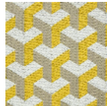
0755-12 CERAMIC M1 - CITRON