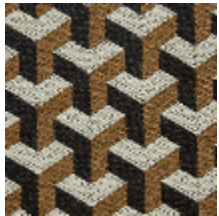
0755-01 CERAMIC M1 - HAVANE