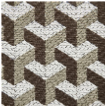
0755-02 CERAMIC M1 - ECORCE