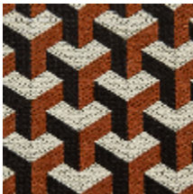
0755-08 CERAMIC M1 - TOMETTE