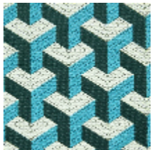
0755-07 CERAMIC M1 - PAON *