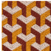
0755-11 CERAMIC M1 - MANGUE