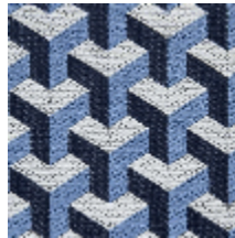
0755-04 CERAMIC M1 - AZUR