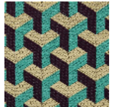
0755-06 CERAMIC M1 - DIABOLO