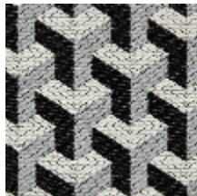
0755-09 CERAMIC M1 - POIVRE