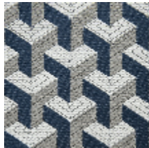
0755-03 CERAMIC M1 - NAUTIQUE