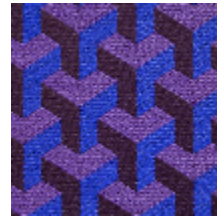
0755-05 CERAMIC M1 - MYRTILLE