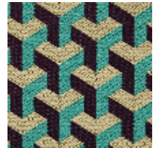
0755-06 CERAMIC M1 - DIABOLO