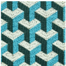
0755-07 CERAMIC M1 - PAON *