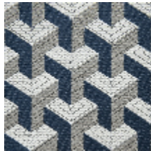
0755-03 CERAMIC M1 - NAUTIQUE