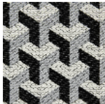
0755-09 CERAMIC M1 - POIVRE