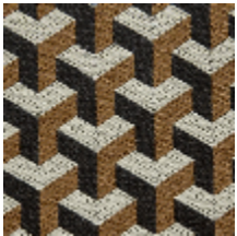
0755-01 CERAMIC M1 - HAVANE