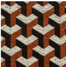
0755-08 CERAMIC M1 - TOMETTE