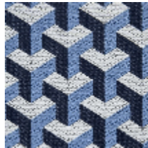
0755-04 CERAMIC M1 - AZUR