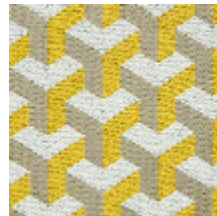
0755-12 CERAMIC M1 - CITRON