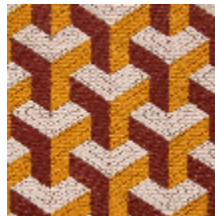
0755-11 CERAMIC M1 - MANGUE