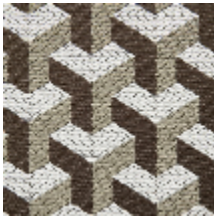
0755-02 CERAMIC M1 - ECORCE