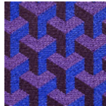
0755-05 CERAMIC M1 - MYRTILLE