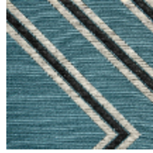
0760-06 CORRIDOR M1 - PETROLE *