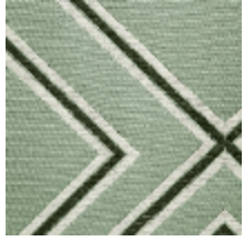
0760-01 CORRIDOR M1 - SAUGE *