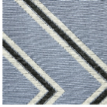
0760-02 CORRIDOR M1 - LAVANDIN *