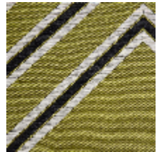
0760-07 CORRIDOR M1 - MOUSSE *