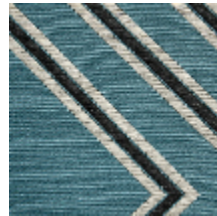
0760-06 CORRIDOR M1 - PETROLE *