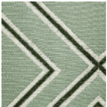
0760-01 CORRIDOR M1 - SAUGE *