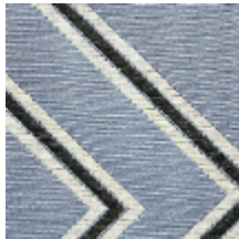
0760-02 CORRIDOR M1 - LAVANDIN *