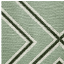
0760-01 CORRIDOR MI - SAUGE *