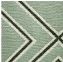
0760-01 CORRIDOR M1 - SAUGE *