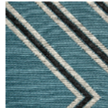
0760-06 CORRIDOR M1 - PETROLE *