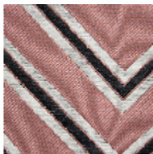
0760-09 CORRIDOR M1 - CANDY *