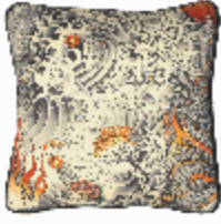
7608-02 COUSSIN TENDER GOLD