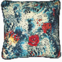
7608-01 COUSSIN TENDER BENGALE