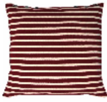
7623-02 COUSS PETIT MARIN ROUG/ECRU