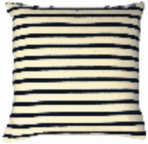
7623-01 COUSS PETIT MARIN ECRU/BLEU