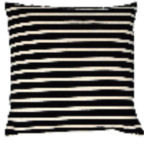
7623-03 COUSS PETIT MARIN NOIR/ECRU