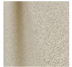
0795-24 DANDY M1 - SABLE