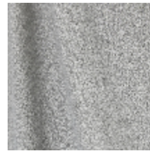
0795-23 DANDY M1 - SILEX