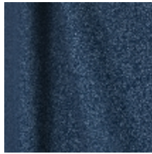
0795-15 DANDY M1 - PETROLE