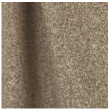
0795-20 DANDY M1 - DUNE *