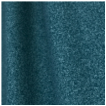
0795-14 DANDY M1 - CANARD *