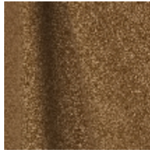
0795-09 DANDY M1 - GAZELLE *