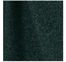
0795-13 DANDY M1 - SAPIN *