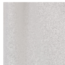
0795-26 DANDY M1 - CRAIE *