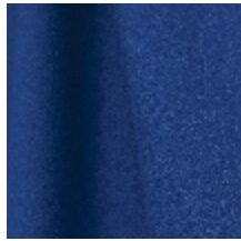
0795-16 DANDY M1 - COBALT *