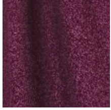
0795-01 DANDY M1 - BORDEAUX *