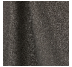
0795-19 DANDY M1 - VISON *