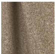
0795-20 DANDY M1 - DUNE *