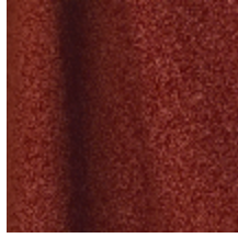
0795-03 DANDY M1 - SANGUINE *