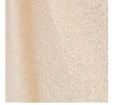
0795-06 DANDY M1 - POUDRE *