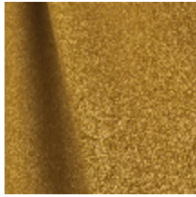
0795-08 DANDY M1 - OCRE *