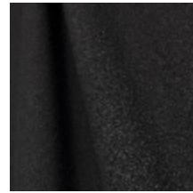
0795-18 DANDY M1 - CHARBON *