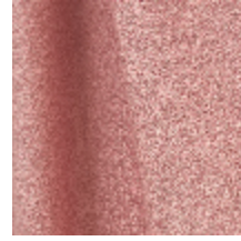
0795-05 DANDY M1 - BLUSH *