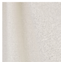
0795-25 DANDY M1 - IVOIRE *