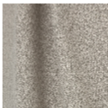
0795-21 DANDY M1 - LIN *