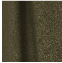
0795-10 DANDY M1 - KAKI *