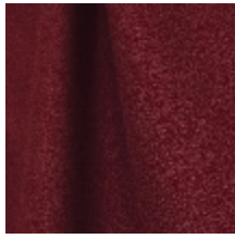
0795-02 DANDY M1 - GRENAT