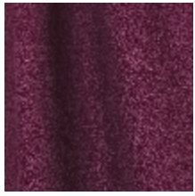
0795-01 DANDY M1 - BORDEAUX