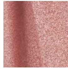
0795-05 DANDY M1 - BLUSH