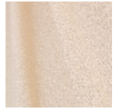
0795-06 DANDY M1 - POUDRE