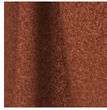
0795-04 DANDY M1 - TERRACOTTA