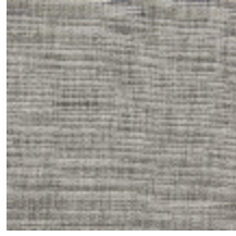
0796-03 PANAMA - FICELLE