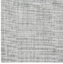
0796-02 PANAMA - PIERRE