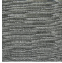
0796-04 PANAMA - SILEX *