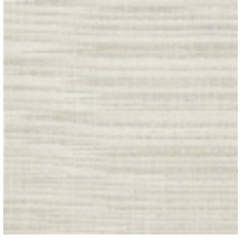
0796-01 PANAMA - CRAIE