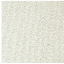
0802-08 LAGO M1 - NEIGE