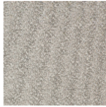
0802-10 LAGO M1 - TOURTERELLE