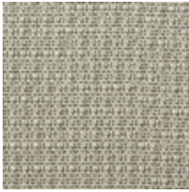
0804-08 DONNA MI - SABLE