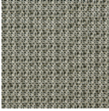
0804-02 DONNA MI - PEPPER