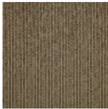
0806-20 RIGA M1 - TAUPE