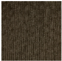
0806-19 RIGA M1 - VISON