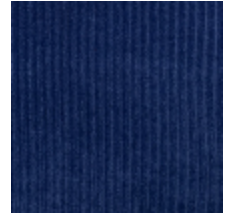
0806-30 RIGA M1 - OUTREMER