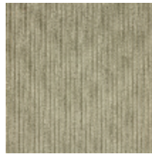
0806-22 RIGA M1 - GALET