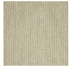
0806-24 RIGA M1 - ALBATRE