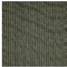
0806-21 RIGA M1 - ALUMINIUM