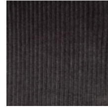
0806-29 RIGA M1 - TRUFFE