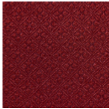
4244-01 BOSQUET - CRAMOISI