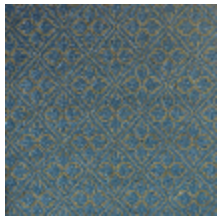
4244-07 BOSQUET - PRUSSE