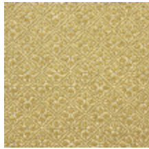
4244-03 BOSQUET - MORDORE