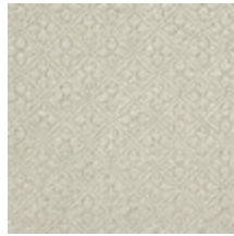
4244-04 BOSQUET - IVOIRE