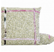
7771-03 COUSSIN ENCADRES AMANDE *