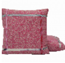
7771-04 COUSSIN ENCADRES FUCHSIA *