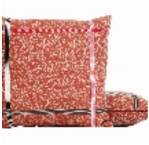
7771-02 COUSSIN ENCADRES BRIQUE *