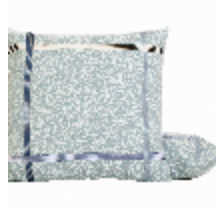
7771-05 COUSSIN ENCADRES CIEL *