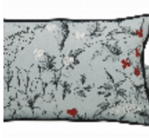
7803-01 COUSSIN BRIDGE MULTICO *